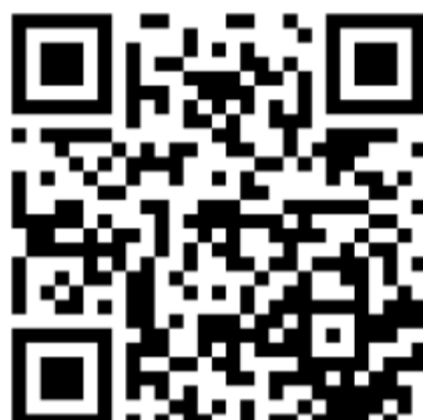
BOUQUET 2019-2021 (Humans rights and humanitarian law + International law)