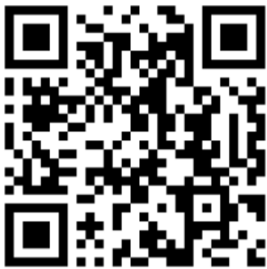
BOUQUET 2020-2021 (Hart + Bloomsbury)