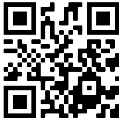
Law & criminology 2020-2021