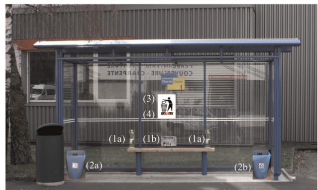
Figure 1. Experimental set up at bus stations. Three items of garbage (2 PVC bottles (1a) and a newspaper (1b)) were placed on the bus stop bench. Two experimental wastebaskets with signs, one for plastic (2a) and one for paper (2b) were placed, one at each side of the bus stop bench. Above the bus stop bench (in eye height, about 1.5 m) a symbolic sign (3) indicating to throw away garbage was attached. Below the sign either an image of eyes or flowers (4) was placed. doi:10.1371/journal.pone.0037397.g001

We only included observations in our analyses in which the conditions concerning our question of interest were appropriate, i.e., subjects were alone at the bus stop for at least 2 minutes and subjects positioned themselves in front of the bus stop so they could see, and potentially be affected by the sign and the experimental garbage. We first analysed the overall effect of the treatment on whether or not individuals engaged in garbage clearing. For the detailed analyses of behavioural differences depending on the treatment we only analysed those cases in which people engaged in garbage removal. This is because individuals that did not clear